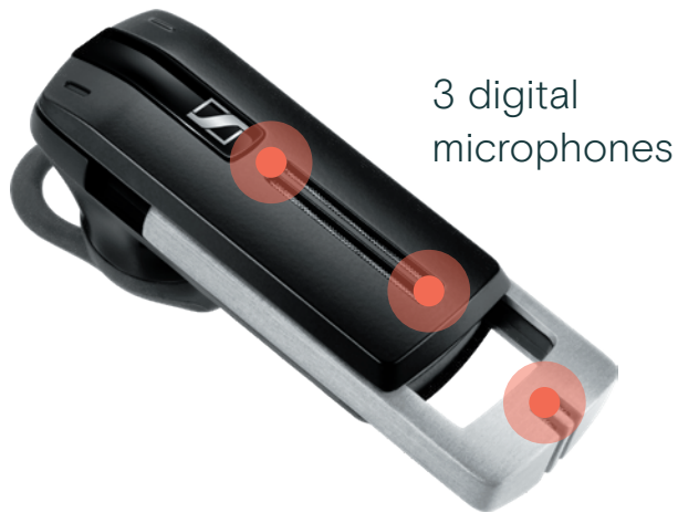
3 digital microphones

Presence also has its own user voice detector that supports the noise reduction algorithms. The advanced own-voice-detector continuously monitors the environment to determine whether the user's own voice is present or not. When detected, the state-of-the-art system reacts immediately to provide optimal speech intelligibility while at the same time reducing disturbing background noise.